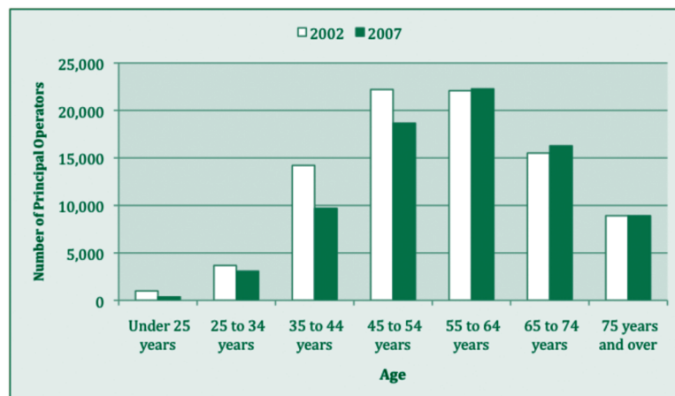
Figure 2. Number of Principal Tennessee Farm Operators by Age (2002 and 2007)

The aging of Tennessee’s farmers implies considerable changes in farm management and ownership over the next decade. These changes pose risks to the continued operation of family farms and to the ability of new and beginning farmers to acquire farmland. In 2007, 61 percent of all Tennessee farmland was controlled by farmers who were more than 55 years old, while only 15 percent was controlled by those less than 45 years old (Table 1).