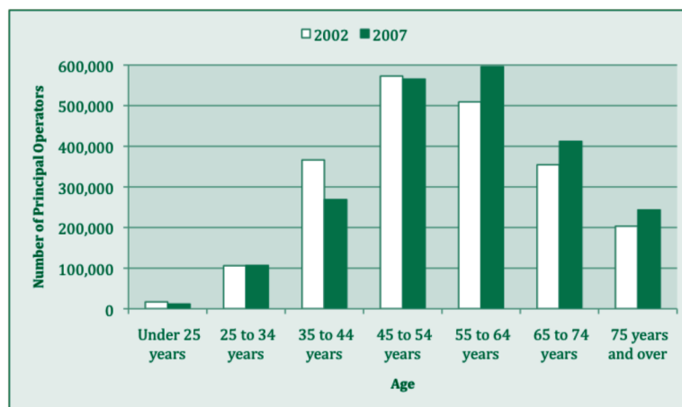
Figure 1. Number of Principal U.S. Farm Operators by Age (2002 and 2007)

The increasing concentration of farmland ownership among farmers over the age of 55 presents a variety of issues for the agricultural sector. First, it suggests that the successful transition of ongoing farm enterprises from the current operator to a successor is going to be an important concern for farmers in the coming years. It also suggests that farms are being transferred more slowly from one generation to the next, compared to the past. Thus, not only is succession planning becoming more important, but it is safe to assume that it is becoming more difficult as well.